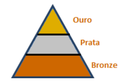
Fig. 1 - Pyramid Synergy

In addition, the PSB also conducts around 03 stages, as schematized below: