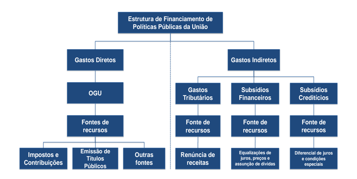
Figure 1 - Financing structure of the Federal Government's public policies

In fact, it is well known that the conventional way of funding public programs and policies, with greater transparency and control, is through direct expenditures recorded in the OGU, according to a rite peculiar to the budget process. It should be noted, in this sense, that the expenditure budget classifications (institutional, functional, by program, among others) bring together elements that enable the monitoring, control and assessment of the execution of policies and programs and, thus, impact and result analyses of this type of public funding.